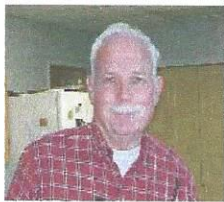
Minutes submitted by WB6QVU, CARS Secretary