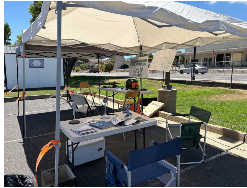
Walt – W6WGY Display