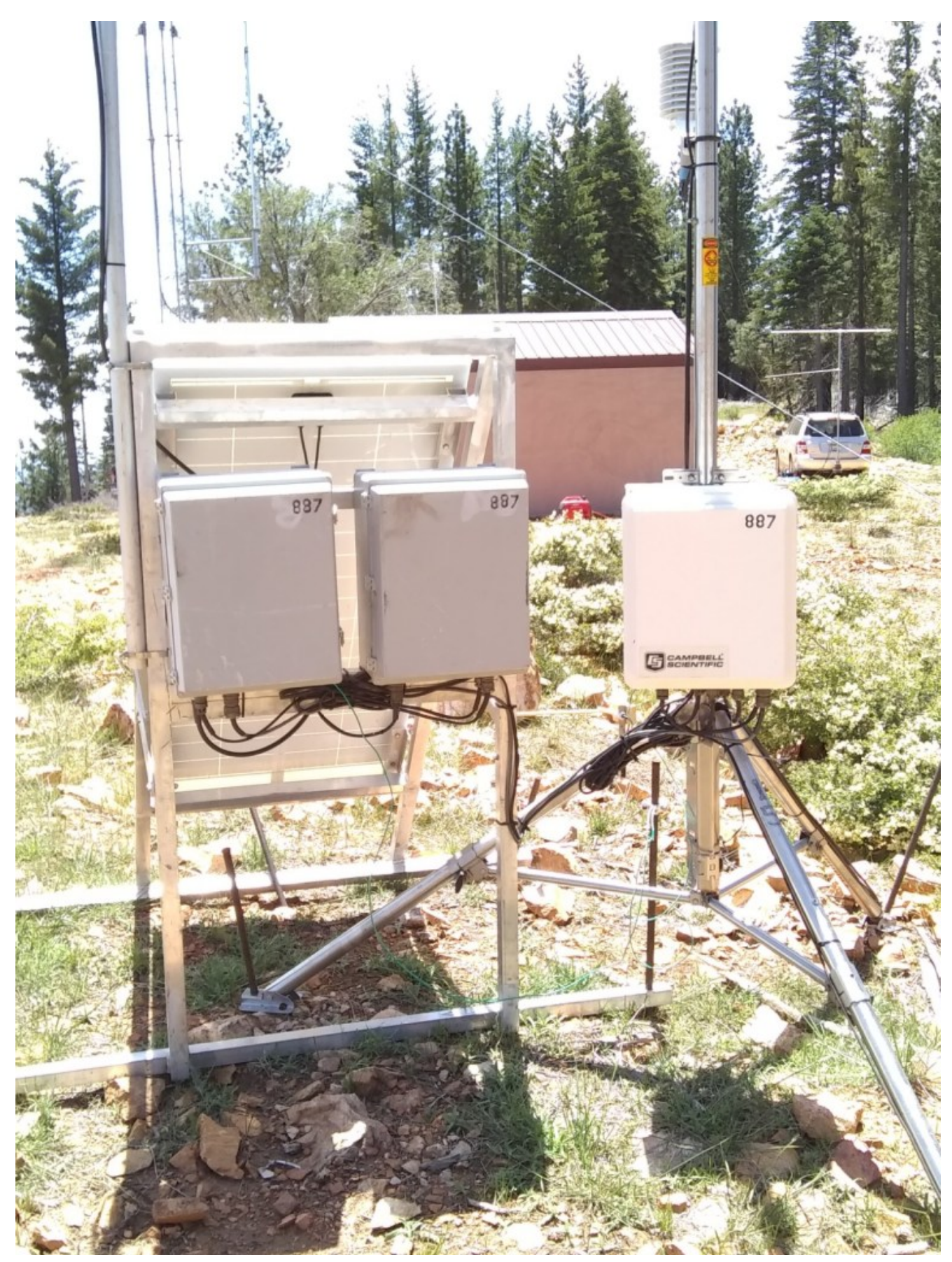
QTH included a cinder block bunker (background) and a solar powered weather station.