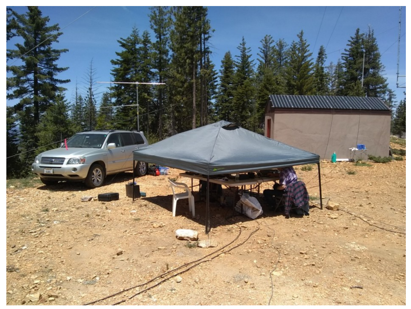
Yes, canopy is very low to block brilliant sunshine and reduce wind drag.