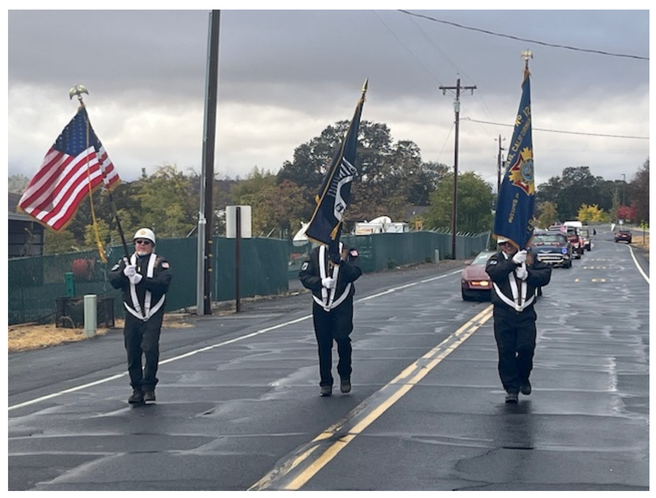
Start Of Parade

The members of Post 12118 here in Copperopolis lead the Parade with many of the Veterans Amateur Radio Operators. They were followed by a student float from the local elementary school, Cal Fire, and a procession of Motorcycles and Classic Cars. A Pancake Breakfast for the Veterans also took place earlier in the morning at the Historical Copperopolis Armory with the Lake Tulloch Quilters showcasing there creations. A local event that takes place every Veterans Day to salute the defenders of liberty.