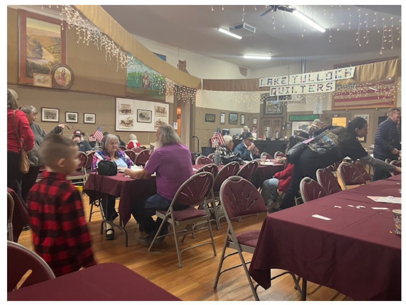
Lake Tulloch Quilters Represented