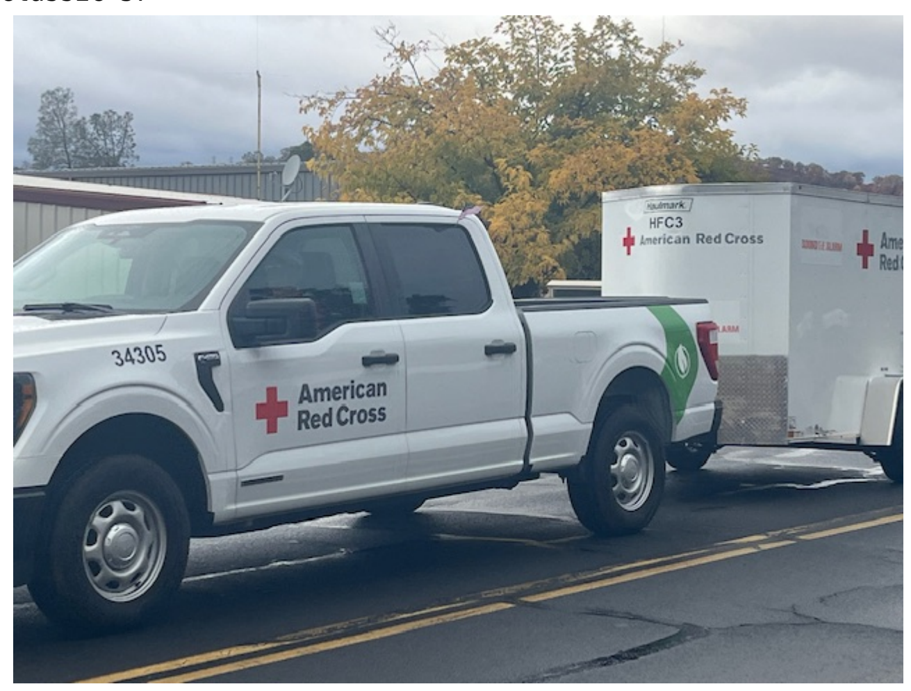
American Red Cross