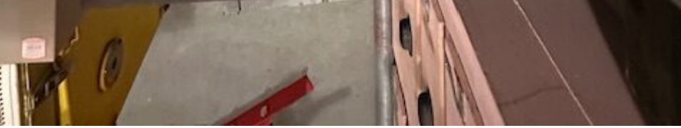
Radio Corp. 200 KW

THIS STATION WAS DESIGNED AND CONSTRUCTED BY THE RADIO CORPORATION OF AMERICA THE 200 KW/HRC FREQUENCY ALEXANDERSON GENERATING EQUIPMENT WAS MANUFACTURED AND INSTALLED BY THE GENERAL ELECTRIC COMPANY THE GENERAL ENGINEERING AND CONSTRUCTION WORK WAS PERFORMED BY THE J. G. WHITE ENGINEERING CORPORATION 1920