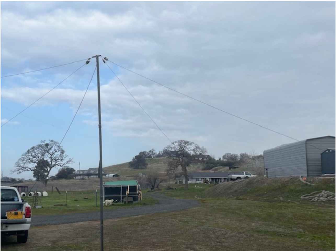
N6AXQ , NVIS Antenna