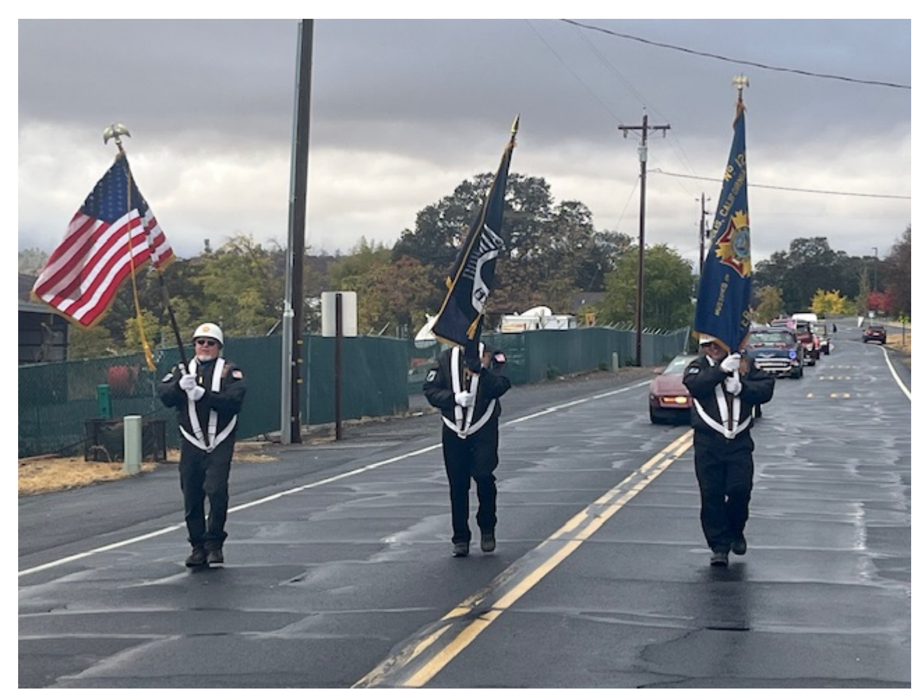
Start Of Parade