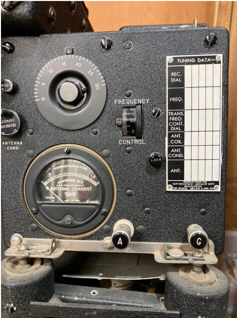
FCC Regulations require updated Radios