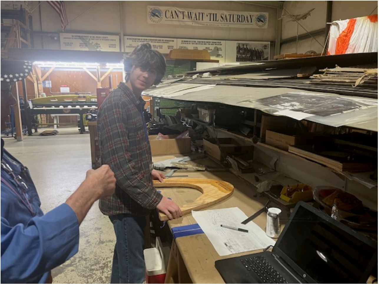
I think I know this craftsman