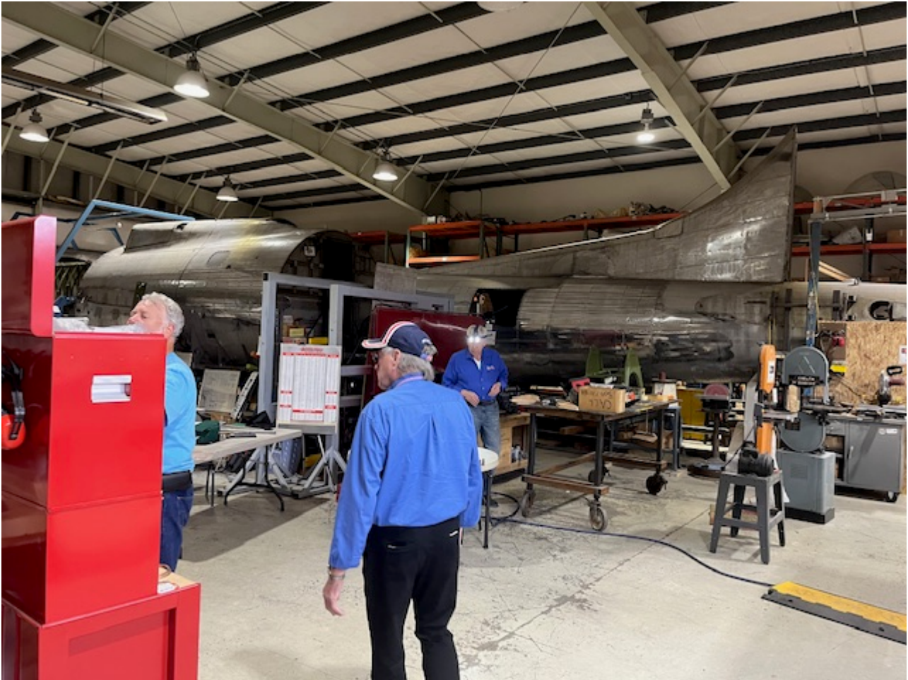
Volunteers at Work