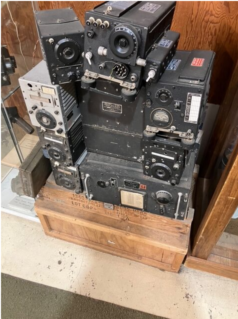
Original Radio Gear