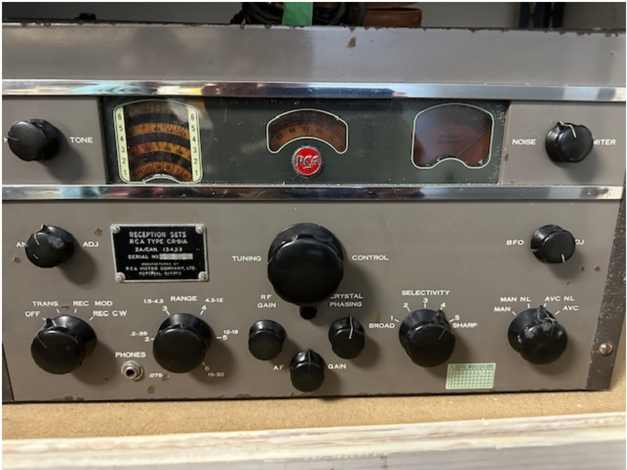
Bolinas Transmitter Site KPH