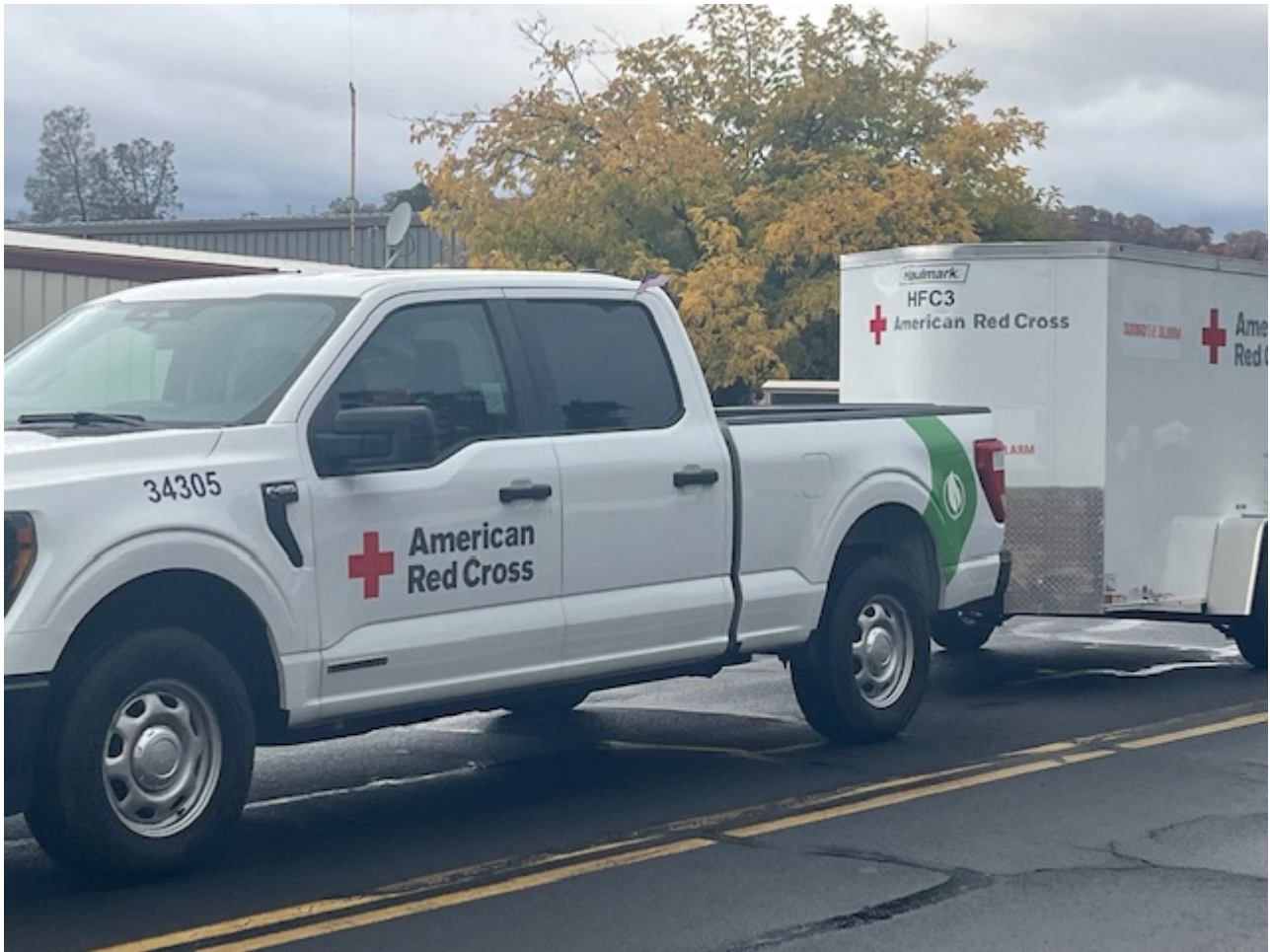
American Red Cross