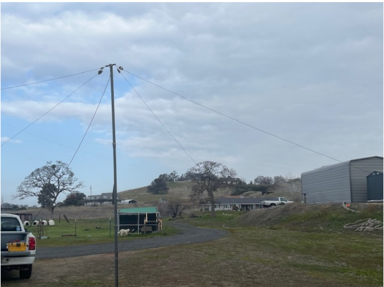
N6AXQ , NVIS Antenna