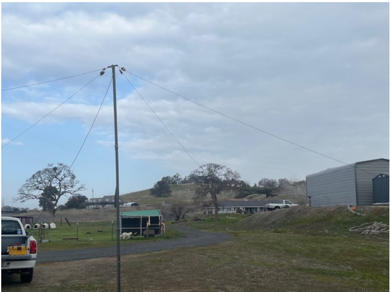
N6AXQ , NVIS Antenna