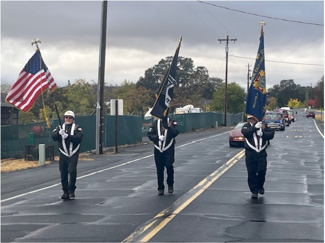
Start Of Parade