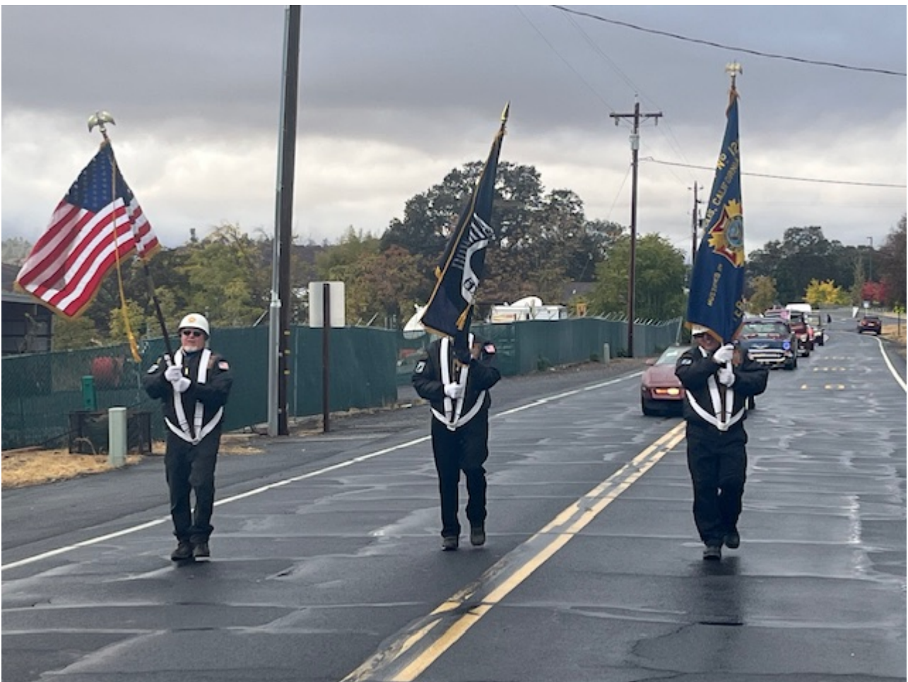
Start Of Parade

The members of Post 12118 here in Copperopolis lead the Parade with many of the Veterans Amateur Radio Operators. They were followed by a student float from the local elementary school, Cal Fire, and a procession of Motorcycles and Classic Cars. A Pancake Breakfast for the Veterans also took place earlier in the morning at the Historical Copperopolis Armory with the Lake Tulloch Quilters showcasing there creations. A local event that takes place every Veterans Day to salute the defenders of liberty.