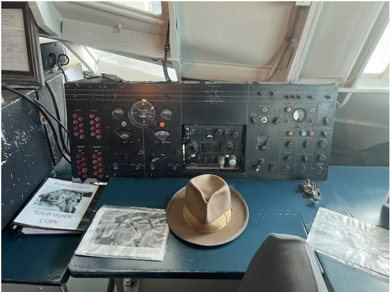
Radio Operator position, the radio is off but the oscillator of the key on right is on. I tapped out a few words