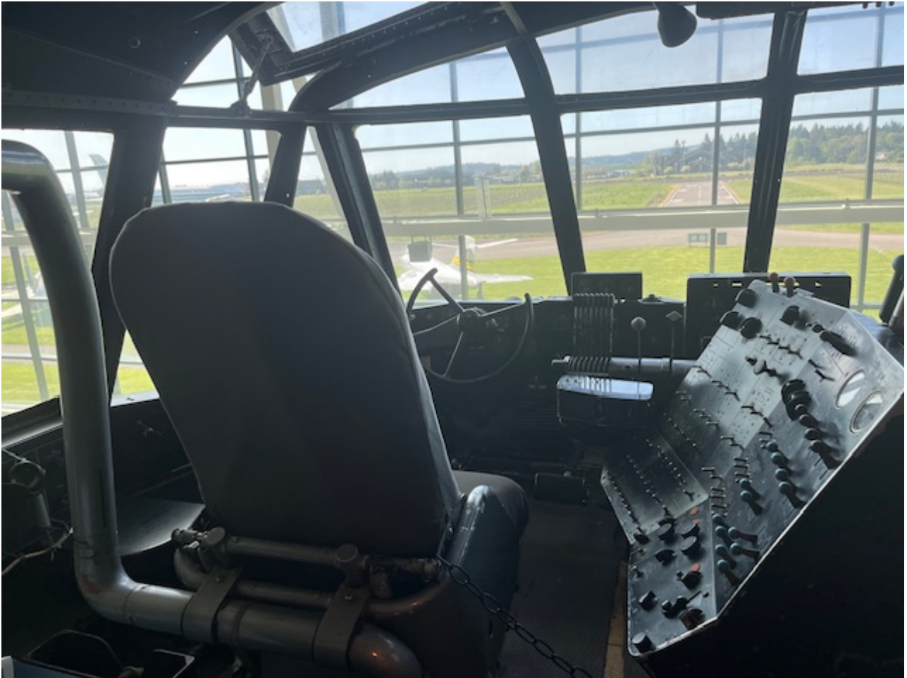
Howard Hughes sat here in the pilots chair