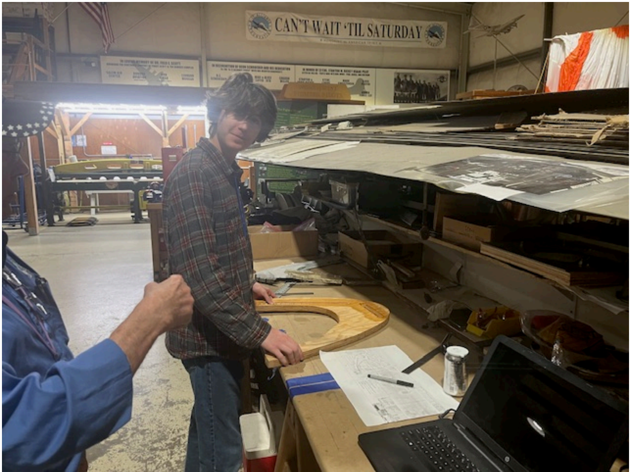
I think I know this craftsman