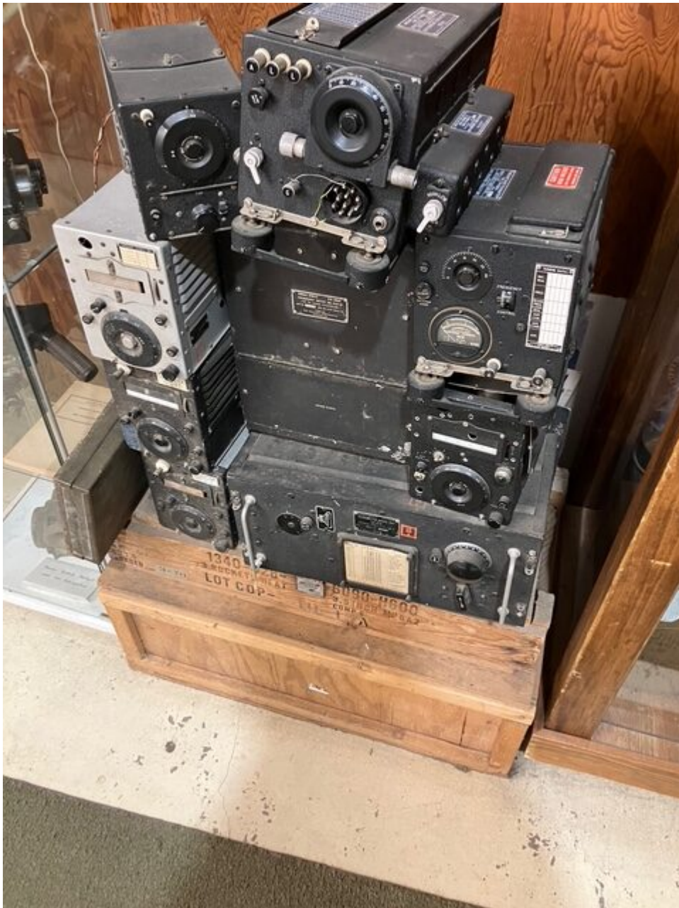
Original Radio Gear