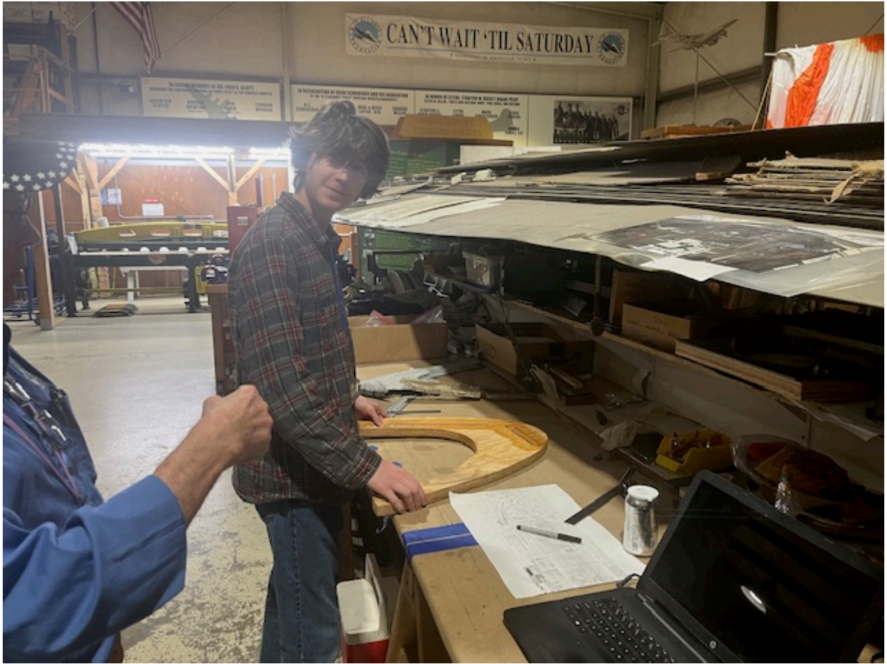
I think I know this craftsman