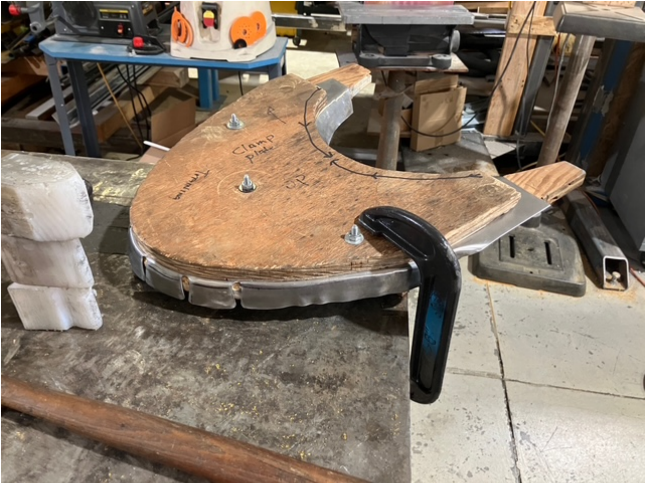
A wooden mold set for metal fabrication on the wing