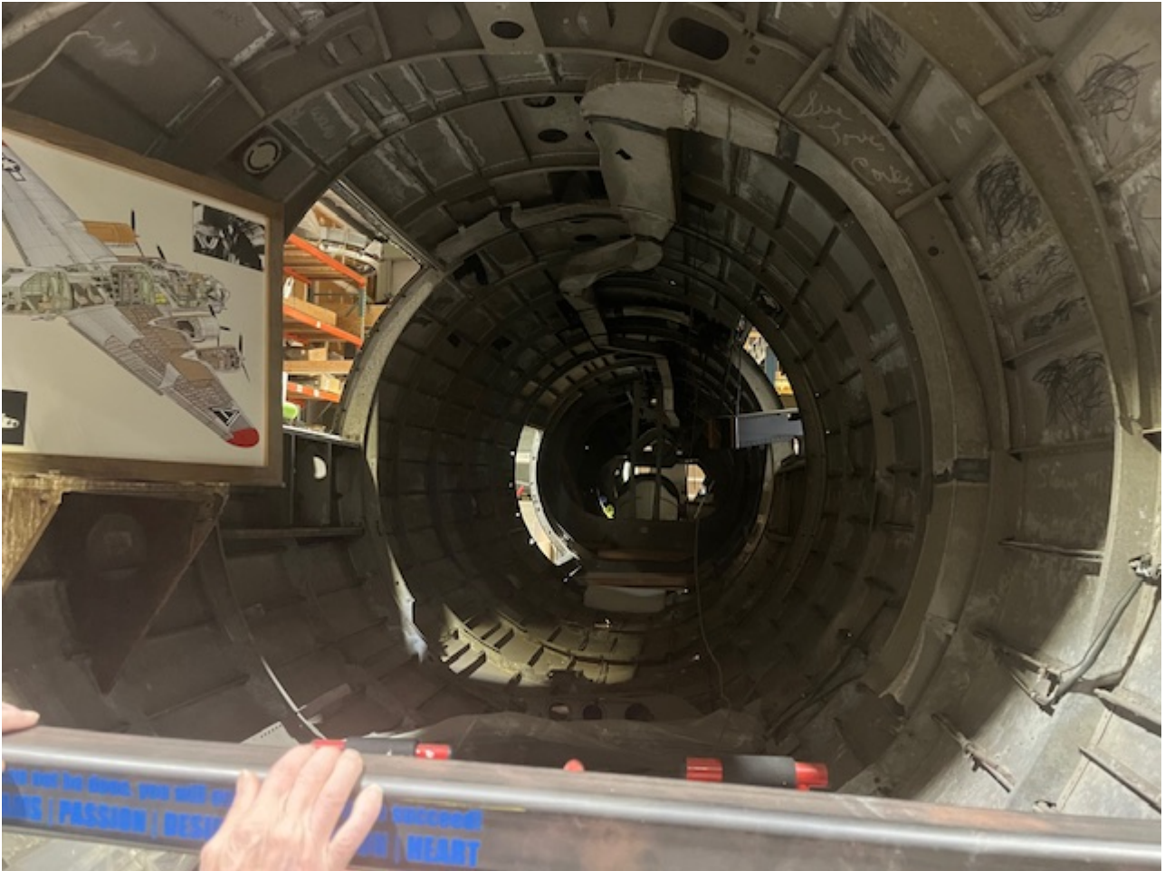
Tail section ready for restoration process