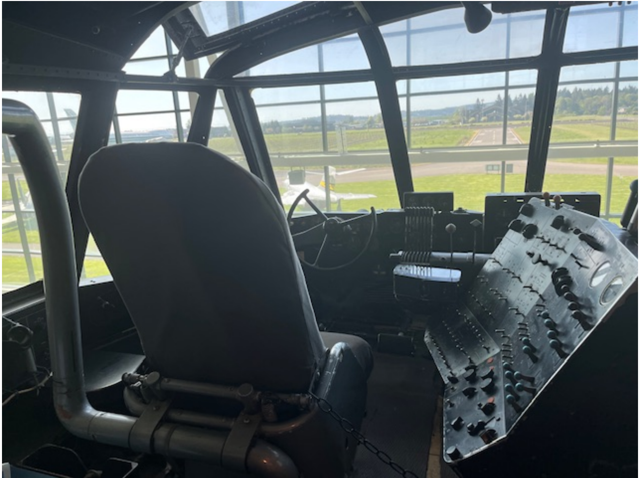
Howard Hughes sat here in the pilots chair