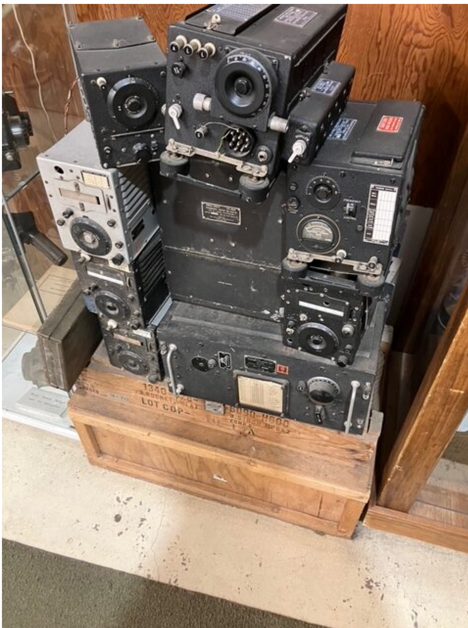
Original Radio Gear

More information can be obtained by going to the B-17 Alliance Foundation at http://b17alliance.com