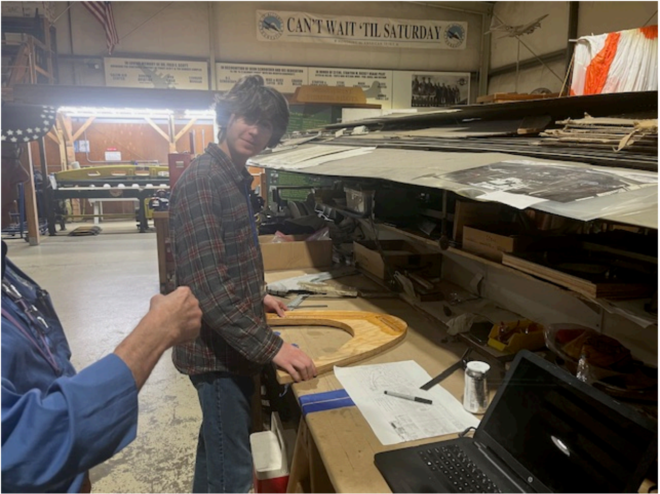
I think I know this craftsman