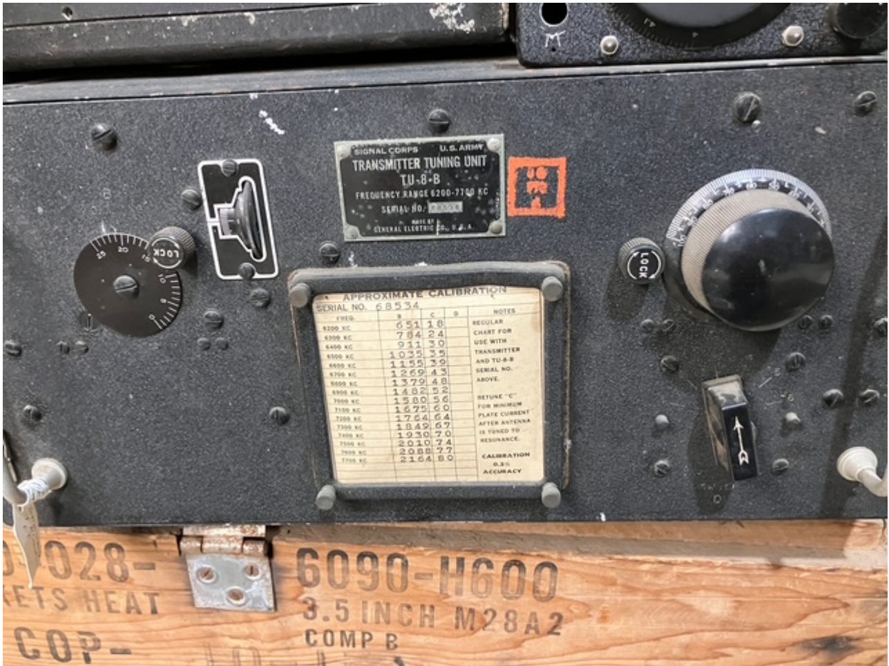
New Radios and Avionics will be installed