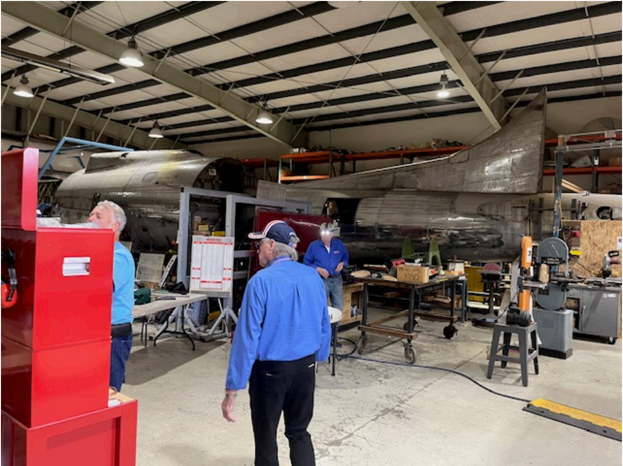
Volunteers at Work