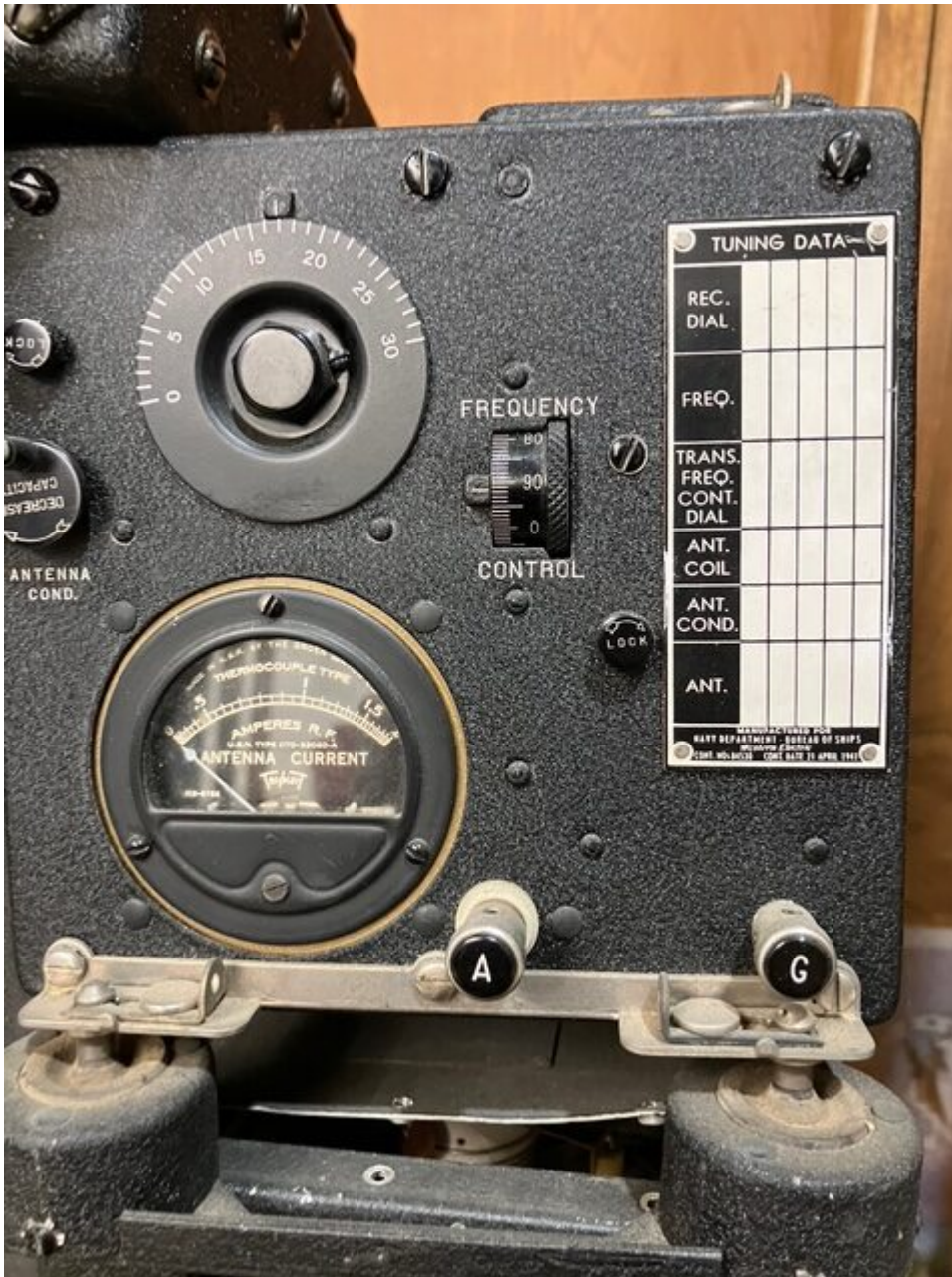
FCC Regulations require updated Radios