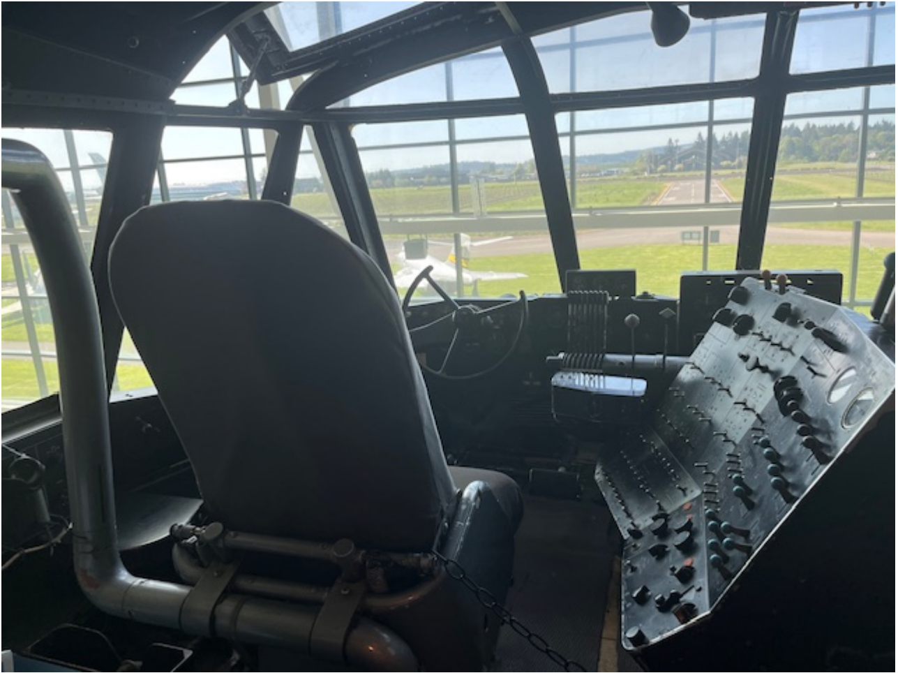
Howard Hughes sat here in the pilots chair