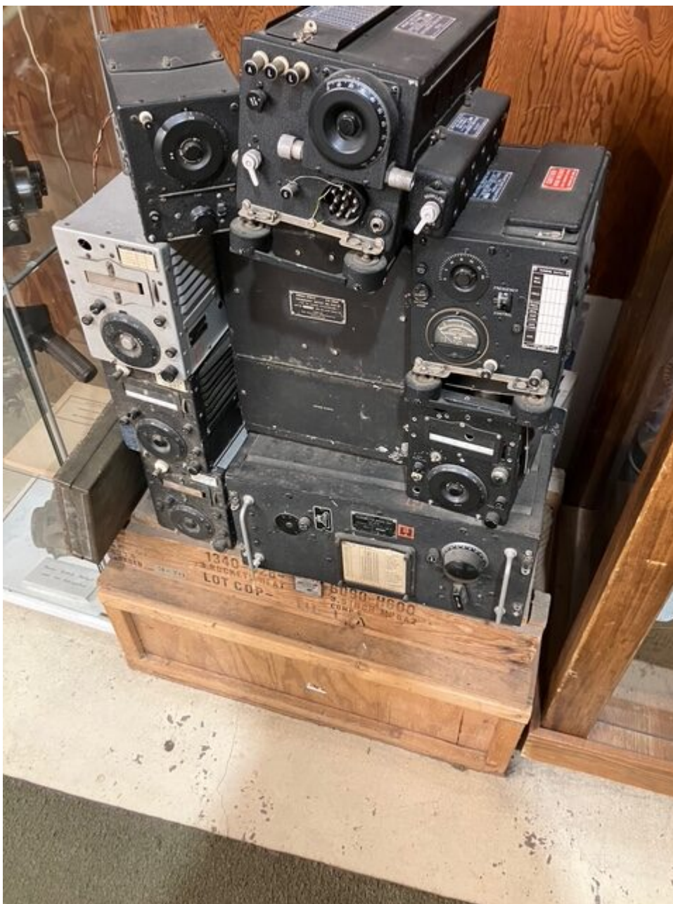
Original Radio Gear

More information can be obtained by going to the B-17 Alliance Foundation at http://b17alliance.com