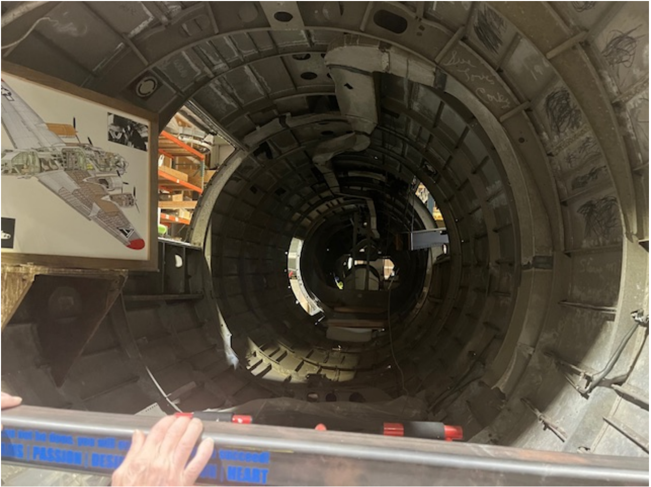
Tail section ready for restoration process