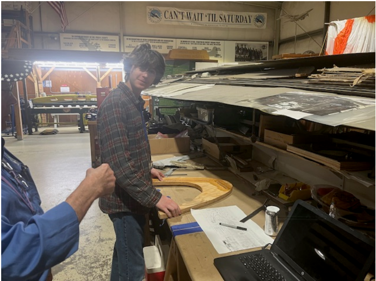
I think I know this craftsman