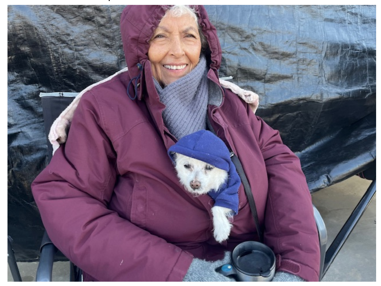
Dee and Women's best friend warming each other