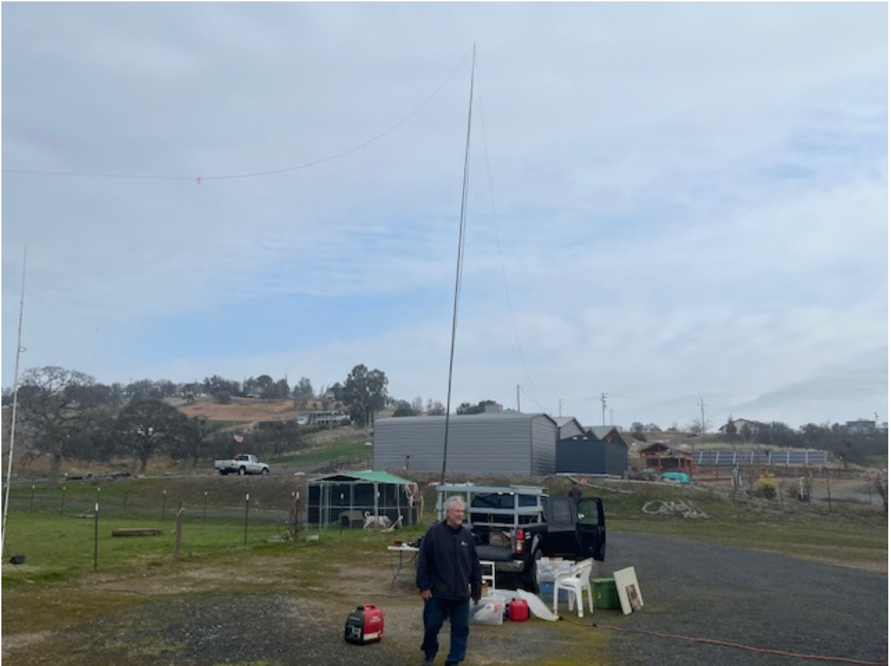
K06F0V surveying the site