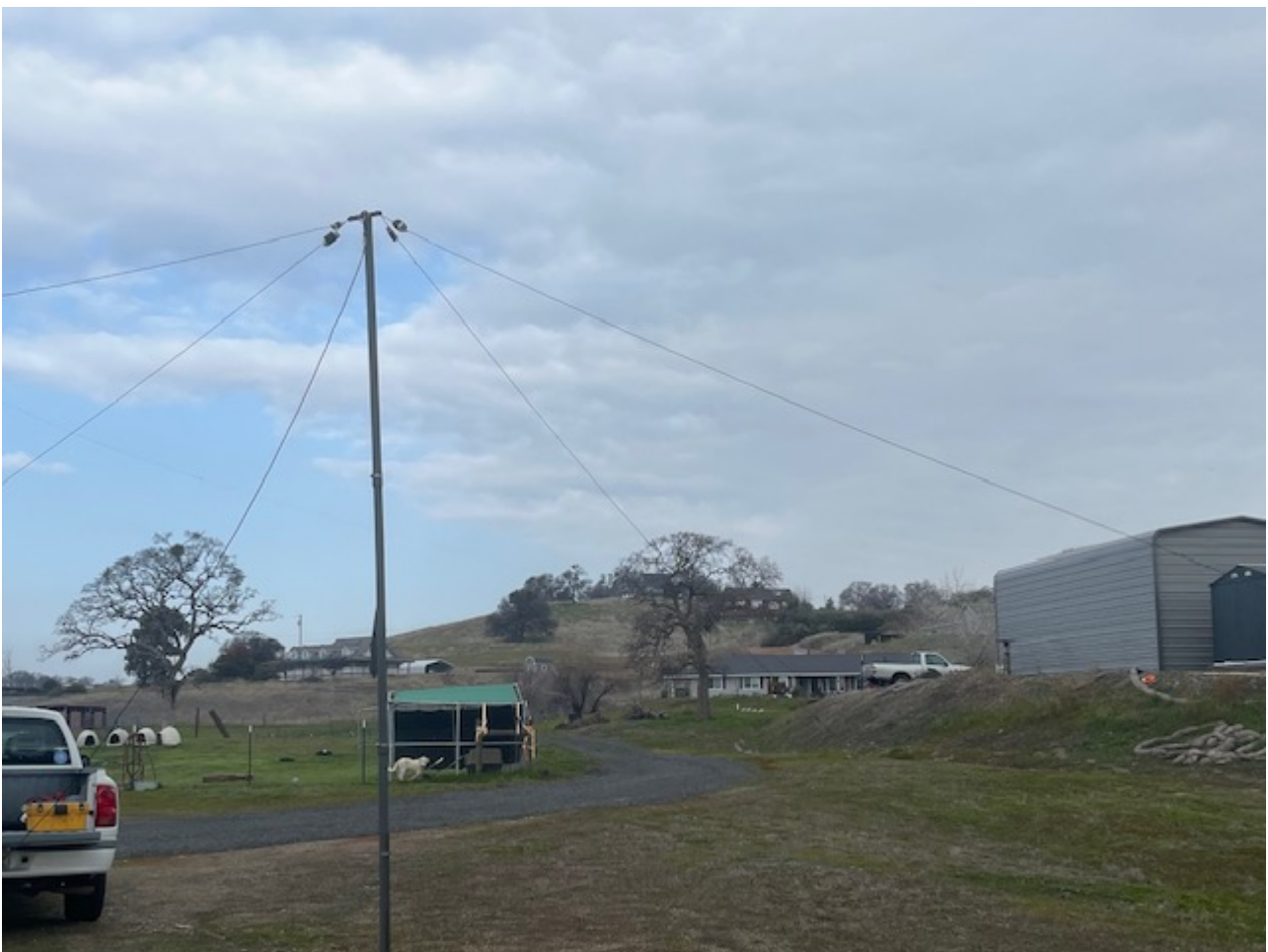
N6AXQ , NVIS Antenna