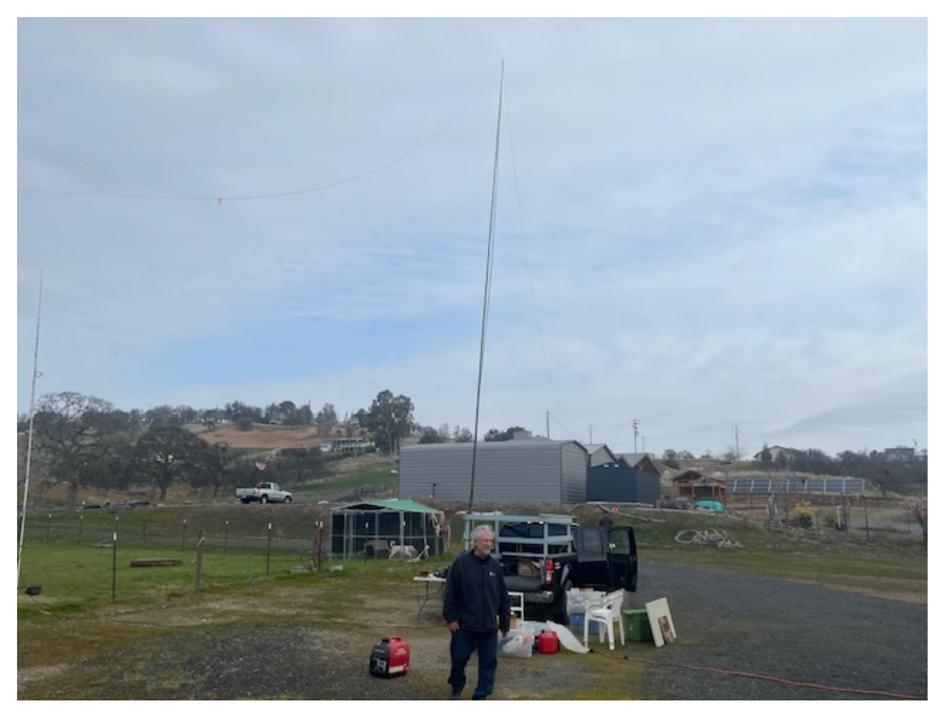
K06F0V surveying the site