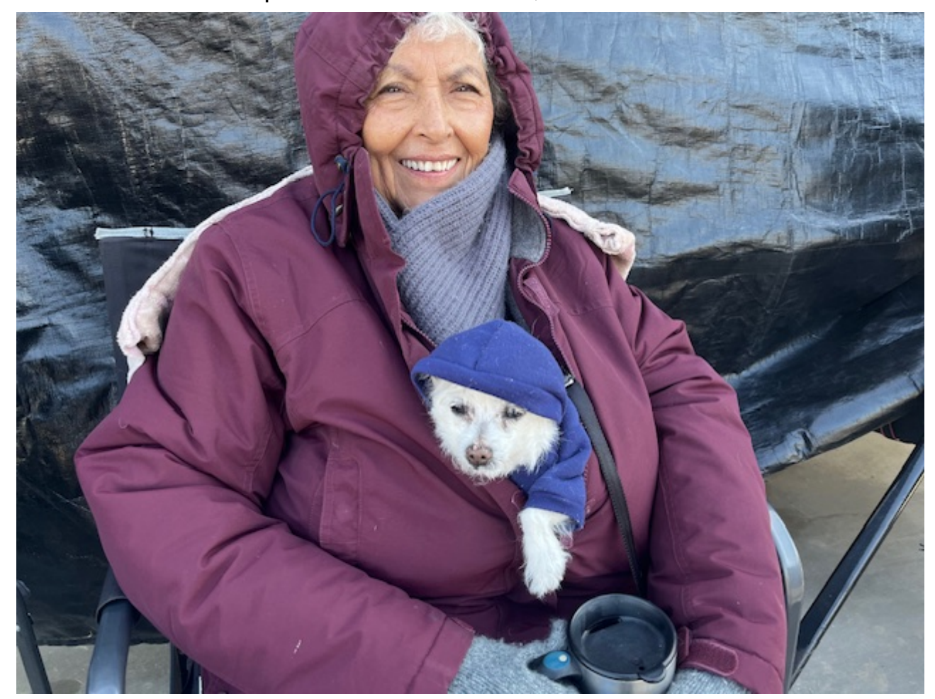
Dee and Women's best friend warming each other