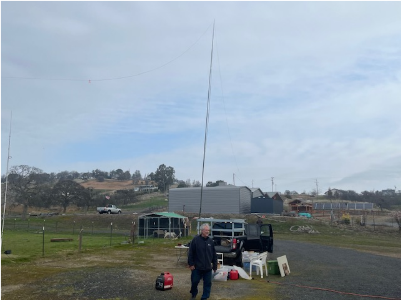
K06F0V surveying the site