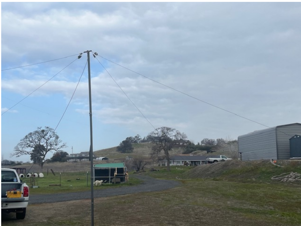
N6AXQ , NVIS Antenna