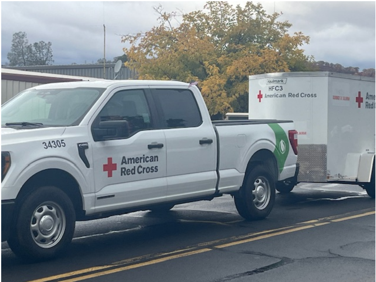
American Red Cross