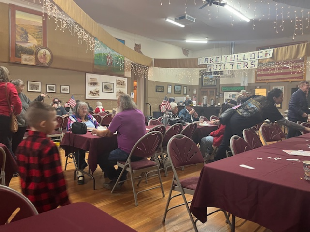
Lake Tulloch Quilters Represented