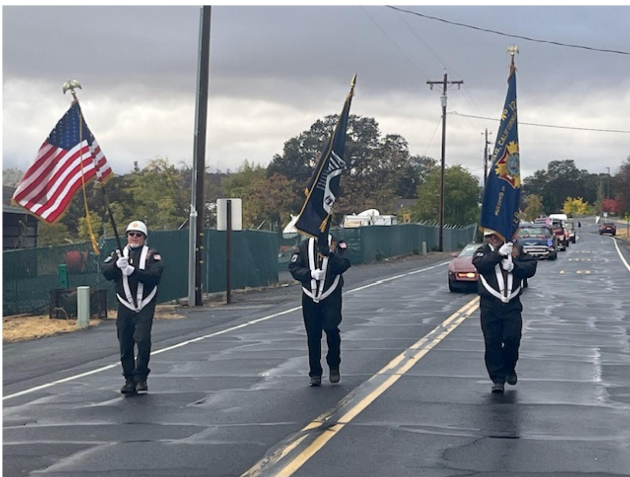
Start Of Parade

The members of Post 12118 here in Copperopolis lead the Parade with many of the Veterans Amateur Radio Operators. They were followed by a student float from the local elementary school, Cal Fire, and a procession of Motorcycles and Classic Cars. A Pancake Breakfast for the Veterans also took place earlier in the morning at the Historical Copperopolis Armory with the Lake Tulloch Quilters showcasing there creations. A local event that takes place every Veterans Day to salute the defenders of liberty.