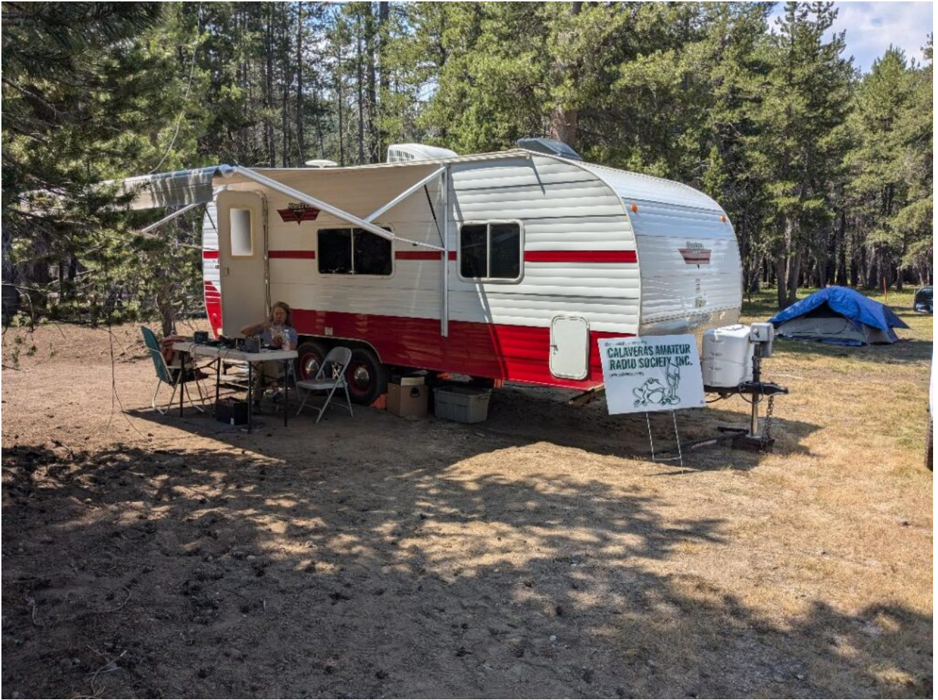
Helen KM6ELE at the table