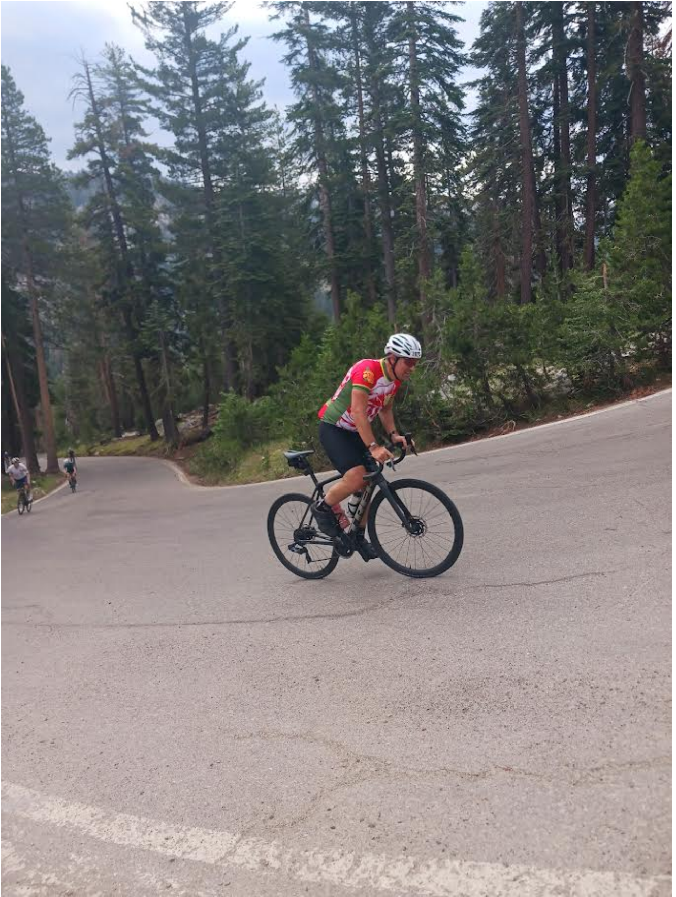
Takin On The Pac Grade