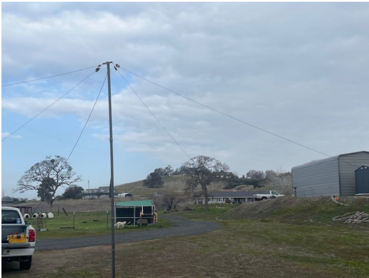
N6AXQ , NVIS Antenna