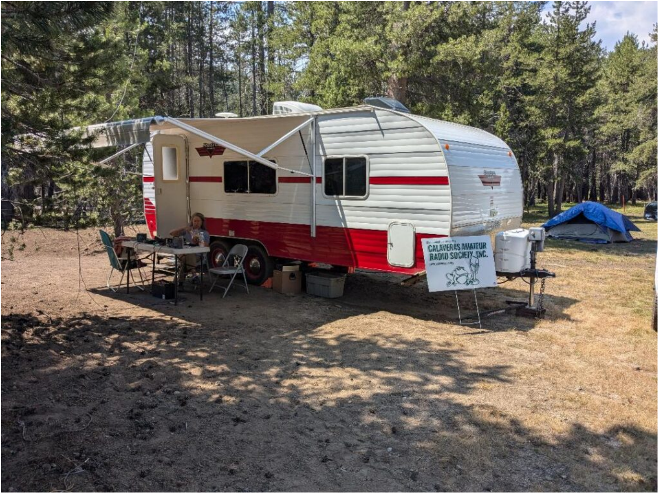
Helen KM6ELE at the table