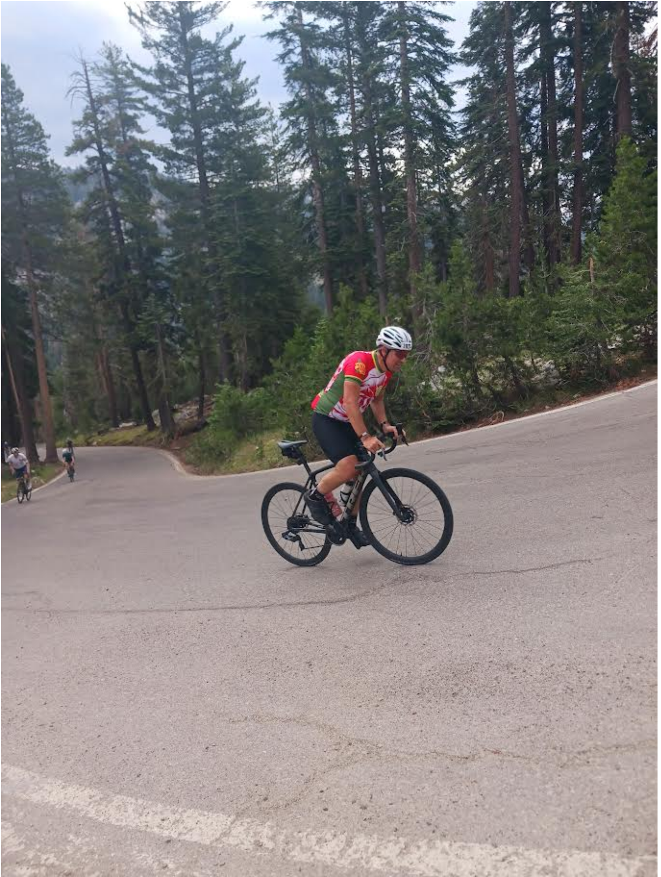
Takin On The Pac Grade